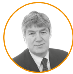
Prof. Padraic MacMathuna

Direct Access: 1800 22 23 33 Rooms: 01 885 8765